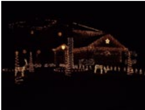
10527 Elk Point Section I