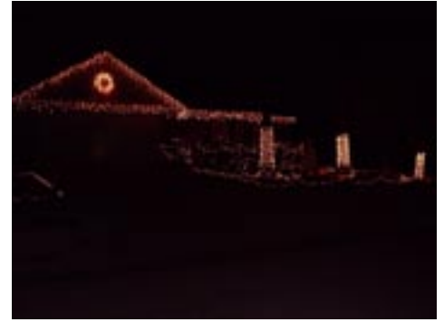
9911 Sand Pass Section III