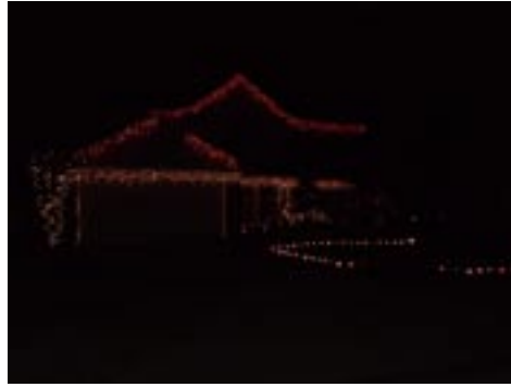
10142 Red Wolf Section II