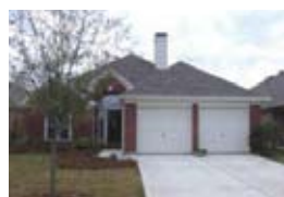
20511 Orchid Blossom - 3/2/2 A FAIRFIELD - $149,900