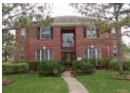
20207 Water Dance Ct. - 4/3.5/3 D Pool, FAIRFIELD - $335,000