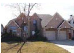
16015 Mustang Glenn - 4/3.5/3 A STABLEWOOD FARMS - $259,000.