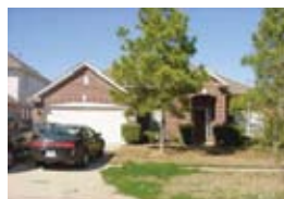
16530 Cypress Thicket - 3or4/2/2 A CYPRESS POINT LAKE ESTATES - $146,500