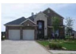
17842 Watsons Bay - 4/3.5/2A SYDNEY HARBOR - $332,900