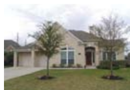
15331 Turning Tree Way - 5/5/2 A, FAIRFIELD - $285,000