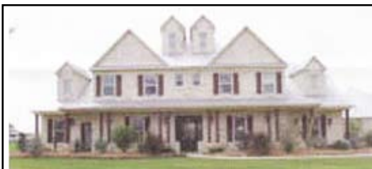
20603 Flagstone Trail - 6/4.5/3 D - Saddle Ridge Estates - $1,095,000