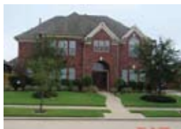
15910 Crooked Lake Way - 4/3.5/3 D FAIRFIELD - $333,000