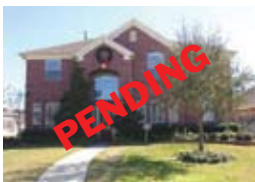
15606 Brookchase - 4/3.5/3+D FAIRFIELD - $264,900