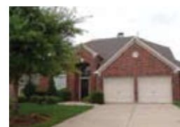
15423 Fairfield Falls Way - 4/2.5/2 A, FAIRFIELD - $187,900

email: don.jeanne@realtor.com www.realtor.com/houston/donandjeanne