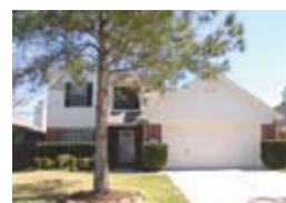
16411 Redbud Berry - 4/2.5/2 A FAIRFIELD - $149,900