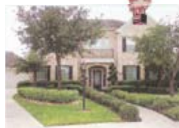
20419 Lake Spring Ct. - 5/3.5/3 D FAIRFIELD - $289,900