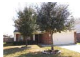
5422 Misty Dawn - 4/2.5/2 A FAIRFIELD - $162,900