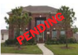
15802 Applerock - 4/3.5/3 D FAIRFIELD - $267,900