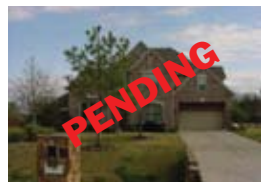
46 Highclere - 5/3.5/3 A GLEANNLOCH FARMS - $599,000