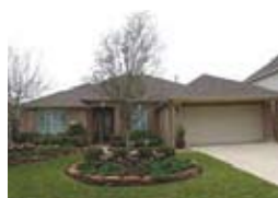
26915 Mossy Leaf - 4/2.5/2 A, BLACKHORSE RANCH - $229,000