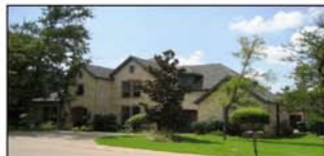
405 Hogans Drive—Trophy Club Hogans Glen $799,900