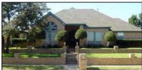
3221 Creighton Lane—Bedford Wendover Estates $324,900