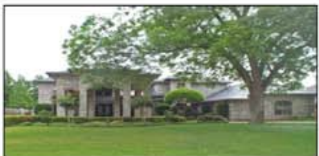
4807 Meandering Way—Colleyville Thornbury Estates $639,500