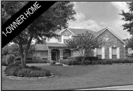
905 MIDLAND CREEK DR BRENWYCK, $475,000