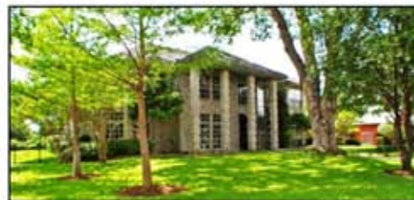
4827 Lakeside Drive—Colleyville Brook Meadows $549,000