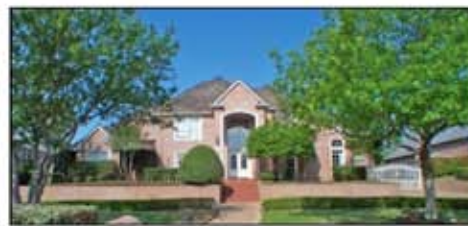
4500 Lakeside Drive—Colleyville Thornbury Estates $725,000