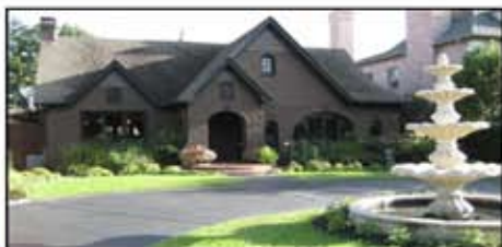
3405 Stanford Avenue—Dallas University Park $1,299,900