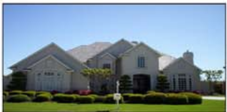
1301 Somerset Court—Colleyville Lakes of Somerset $799,900