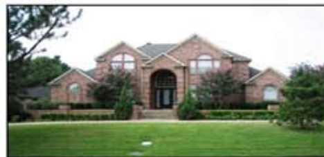
4504 Green Oaks—Colleyville Brook Meadows $539,500