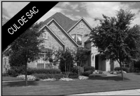
1202 BARLOW BEND HUNTLY MANOR, $725,000