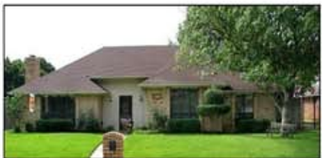
3150 Stone Creek—Grapevine $219,900