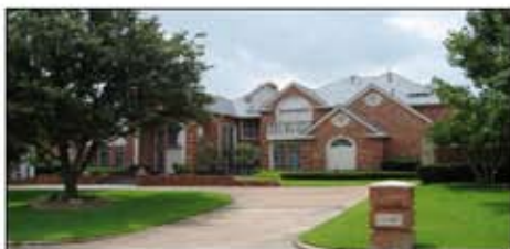
4508 Cresthaven—Colleyville Thornbury Estates $889,900