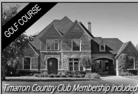
1210 STRATHMORE DR STRATHMORE, $1,000,000