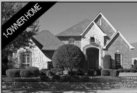
1404 KENSINGTON CT CRESCENT ROYALE, $578,800