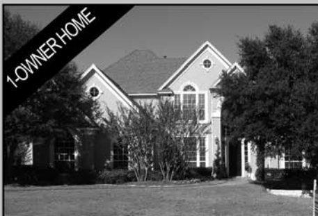
130 BENT TRAIL DR BENT CREEK, $588,800

Statistics as reported by NTREIS as of Jan 18, 2008