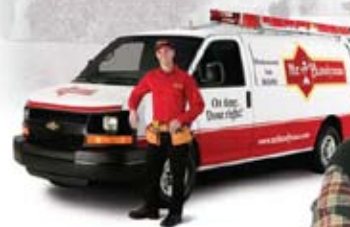
Owner is a 35 Year Cypress Resident