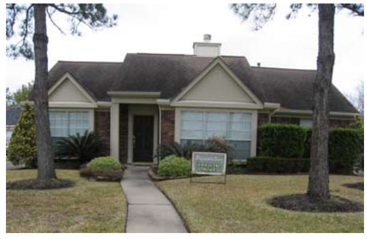
BACK SECTION 10422 Pearl Drive Randy & Qurisha Lucia