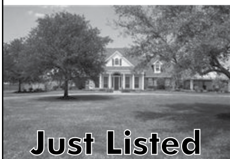
Just Listed 17222 Bending Oak in Cypress Ranch Estates 5 Acres, 4162 sq. ft., Pool & Barn

To get the best in Cypress, work with Cypress' best.