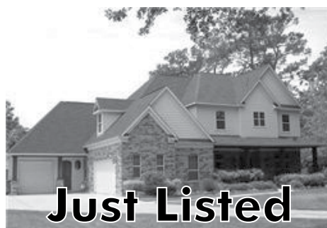
Just Listed 13819 Jarvis - Unrestricted 1.3 Acres, Gorgeous Custom 5200 sq. ft.