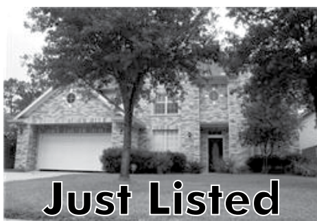
Just Listed 14211 Grove Estates Ln - Cypress Mill Estates Section 2592 sq. ft., Stunning, Quarters