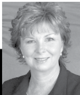
Your Cypress Specialist