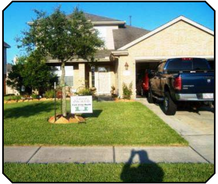
5502 Flower Grove Ct.