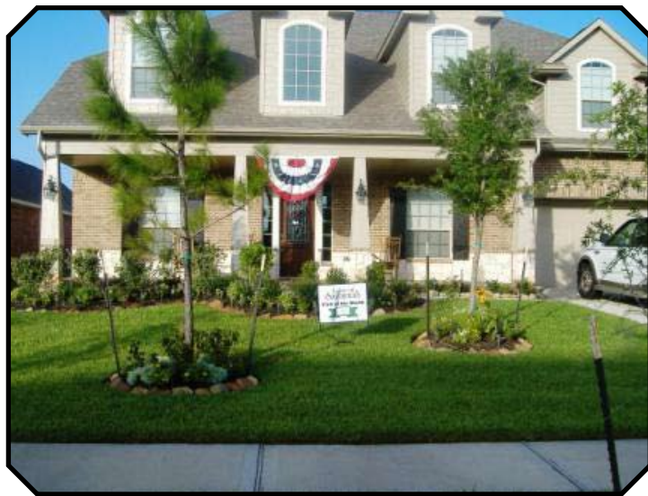
13302 Southern Orchard Ct.