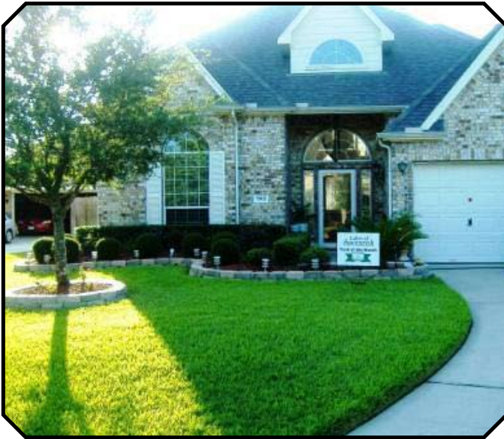
5509 Lilywood Lane