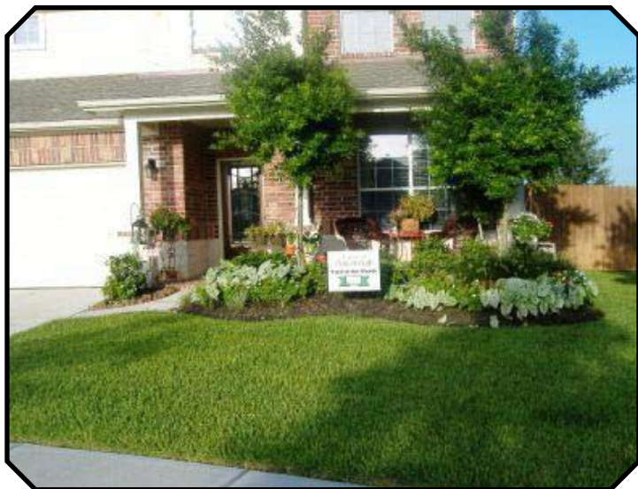
5301 Silver Sage Lane