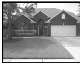
9719 Green Valley Ln.