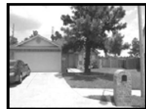
10703 Starlit Meadows

Multi-Million Dollar Producer Since 1995