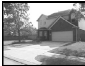
11019 Mystic Moon