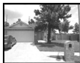
10703 Starlit Meadows

Multi-Million Dollar Producer Since 1995