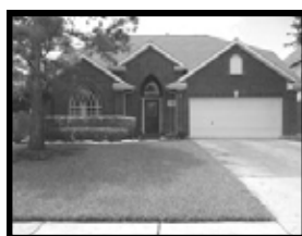
9719 Green Valley Ln.