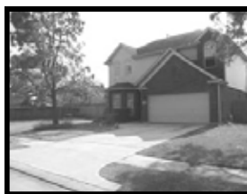
11019 Mystic Moon