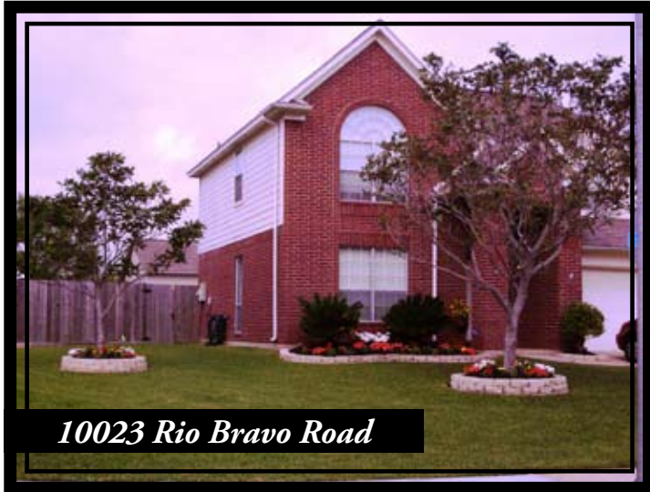
10023 Rio Bravo Road

The green grass is everywhere...and these homes have the greenest. Congratulations to the family at 10023 Rio Bravo Road who received first place for the month. Also congratulations go to the family at 10523 Encino Pass Trail who receive second place this month.