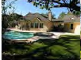
13602 Merilee Ct