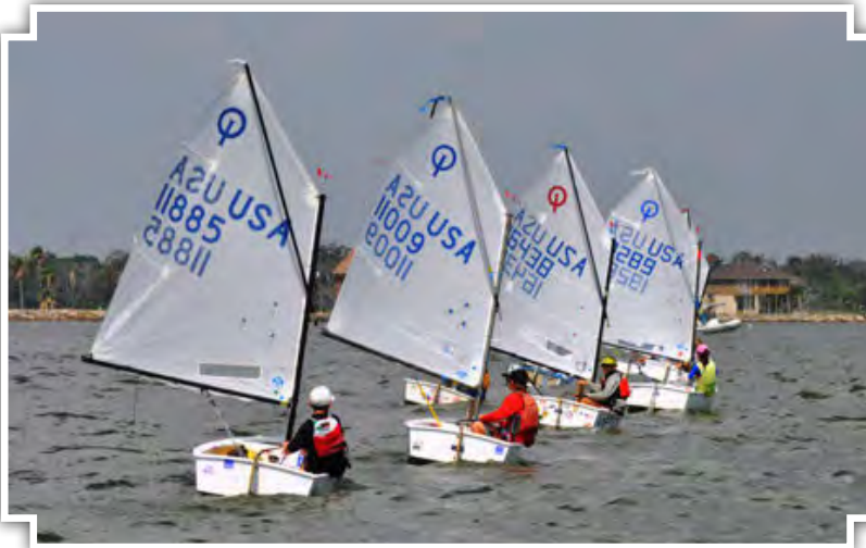
Optimists on the downwind run at the Endless Summer Regatta

Summer Solstice Regatta: Seabrook Sailing Club's annual Summer Solstice Regatta will be held on June 23 and 24, 2012. This year we will be kicking off the regatta on Friday night with fireworks and a keg! We encourage everybody to leave work early and bring a picnic. This regatta is open to all small sailboats and beginner racers are welcome. Lasers, 470's, Sunfish,