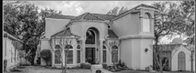
COTTAGE ESTATES IN THE DOMINION

This pristine & beautiful garden home features a perfect floor plan, lots of light, high ceilings, rich wood floors & tile throughout, custom moldings, many built-ins, an open kitchen & a huge master suite. Detached Casita has 1/2bath. Fully fenced with small yard. MLS# 952580