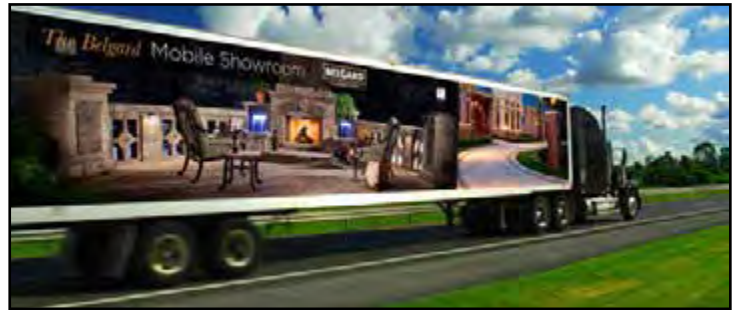
The Belgard Hardscapes Mobile Display, a semi truck filled with ideas to create the picture-perfect patio, will be featured at the Cy-Fair Home & Garden Show.

“In addition to the more than 200 exhibitors, we have an excellent lineup of speakers that are well known, enthusiastic and have a wealth of experience - just what it takes to get you started on the right track with your home improvement projects,” added Wood.