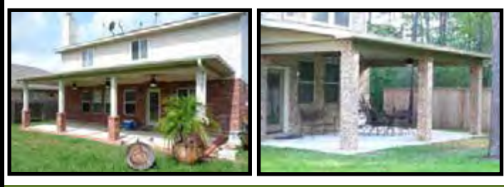
Creating Comfort for Outdoor Living... with Affordable Shade Patio Covers!

Visit our galleries to view hundreds of photographs of finished projects...from very happy customers. AffordableShade.com 713-574-4648