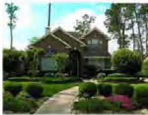
14803 Cantwell Bend