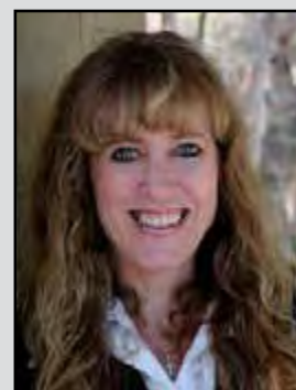
Resident of Eagle Springs