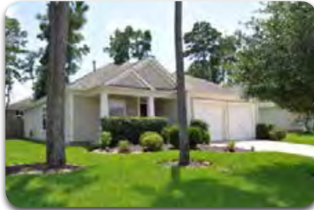
12230 Grand Portage