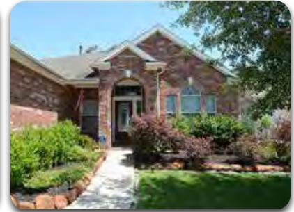
17606 Sierra Creek