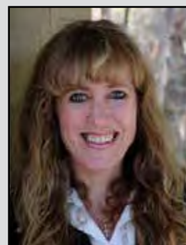
Resident of Eagle Springs