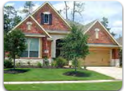
17611 Bridger Bend