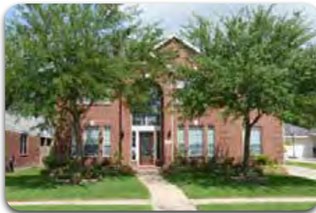
18515 Wild Basin