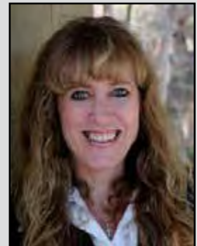
Resident of Eagle Springs