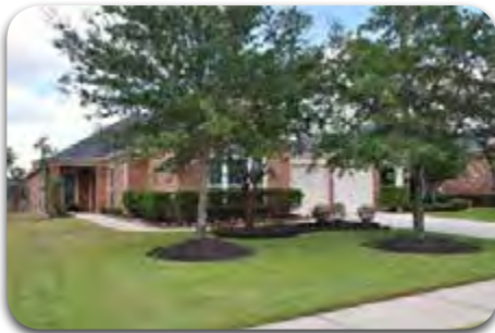
17619 Sequoia View