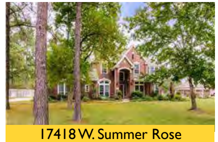
17418 W. Summer Rose

Villages of Cypress Lakes - $192,000 SOLD!