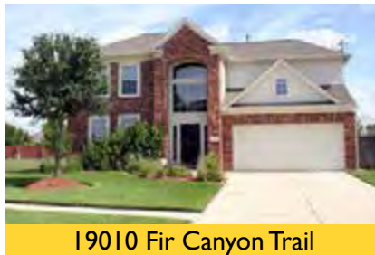
19010 Fir Canyon Trail

Villages of Cypress Lakes - $192,000 SOLD!