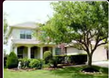
12139 Canyon Arbor Way ..... SOLD .....