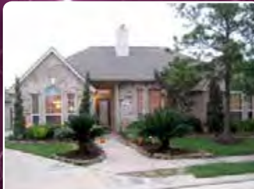
10143 Meridian Lakes Dr. ..... SOLD .....