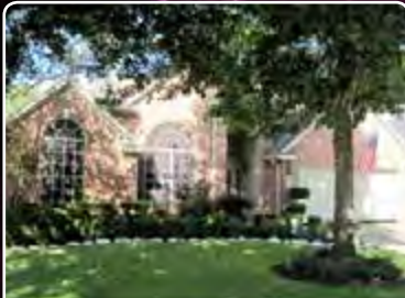
12118 W. Canyon Trace ..... SOLD .....