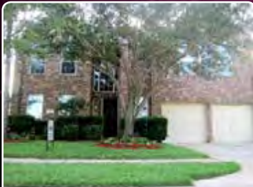
10107 Cottonwood Canyon ..... SOLD .....

INVENTORIES ARE AT RECORD LOWS. LIST YOUR HOME TODAY!