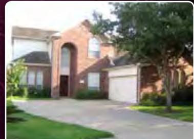
12003 W. Canyon Trace Dr. ..... ACTIVE .....