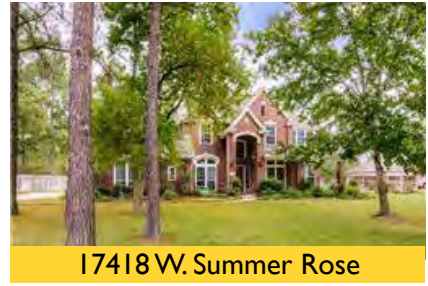
17418 W. Summer Rose

Closed - $428,500 Under Contract in 3 Days