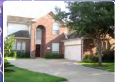
12003 W. Canyon Trace Dr. ..... SOLD .....