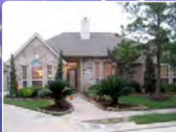
10143 Meridian Lakes Dr. ..... SOLD .....