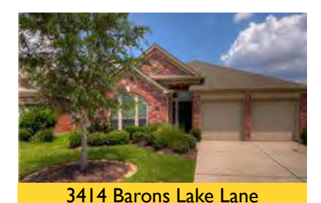
Stone Oak Estates - $172,000