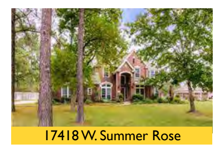
Closed - $428,500 Under Contract in 3 Days