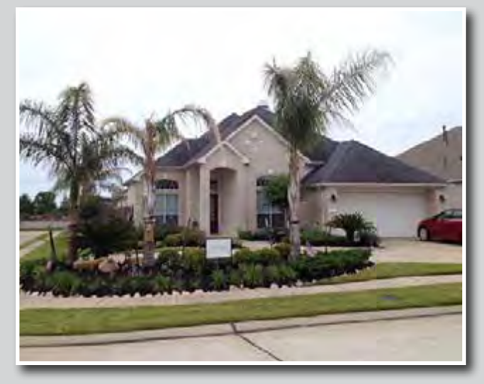
The Yard of the Month for May has been awarded to 17923 Double Bay Road . Congratulations!! Thank you for helping to make us proud to live in Sydney Harbour.