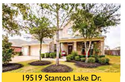
Gates at Canyon Lakes West 5 Bedroom, Gameroom, & Media Room

17419 Wild Rose Ct. Lakes of Rosehill Almost I acre, 5 bedroom