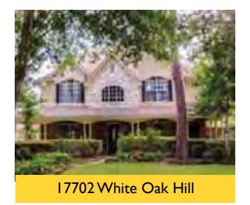
Lakes of Rosehill