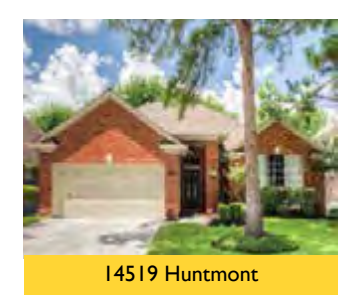
Cypress Mill Sold in less that a Week