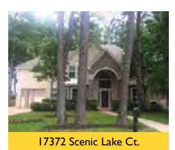
Lakes of Rosehill