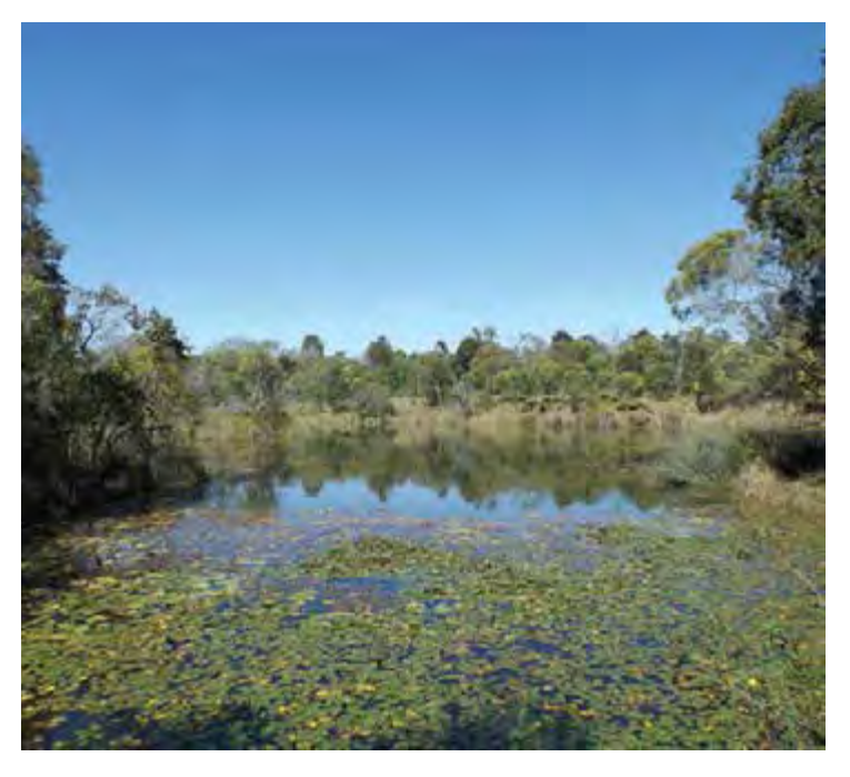
Berrinba Wetlands billabong located in the state of Queensland, Australia

Crescent Head is about 19km south-east of Kempsey on the NSW mid-coast and is famous among wave surfers throughout the world. In fact, the surfing doesn't get much better than around here, especially when, for most of the year, there are long stretches of golden sand that you won't have to share with anyone. Anglers, too, are drawn to the surf and estuarine fishing. From the crest of 100m high Crescent Head you can almost see forever, with coastal views stretching over marine parkland to Hat Head in the north and to Point Plomer to the south.