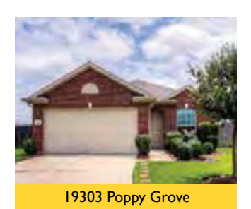
Yaupon Ranch Sold in 3 Days