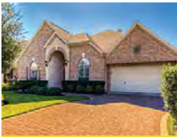
17903 Camp Cove

Sydney Harbor 1 story, 4 bedroom, water front