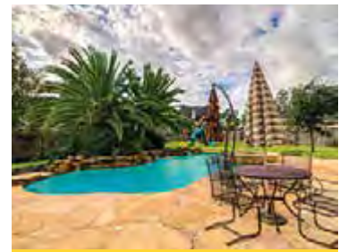
13906 Conner Park

Secluded 13+ acres, 1.5 story, pool backs to riding trails, bring the horses, CFISD