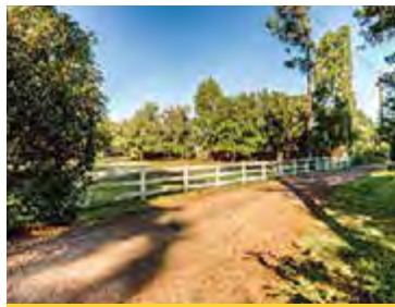
15821 Telge Road

Sydney Harbor 1 story, 4 bedroom, water front