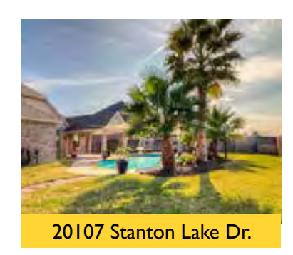
Manned Gate; Resort-Style Backyard 2-story, 4-bdrm w/gameroom & study