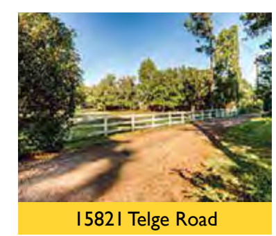
Secluded 13+ acres, 1.5 Story, Pool backs to riding trails, bring the horses, CFISD