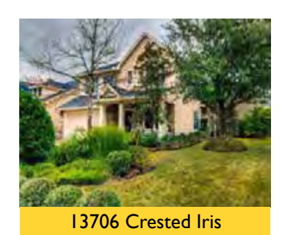
Coles Crossing Just Beautiful, $239,900