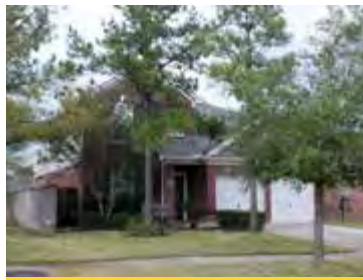
20630 Mauve Orchid Way