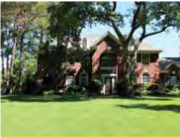
17722 White Oak Hill