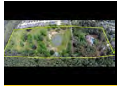
15821 Telge Rd