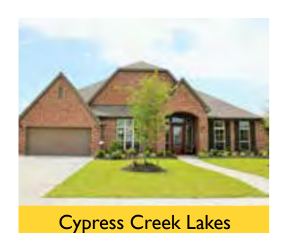
IStory, 4 BR, 4 Car, & Pool!