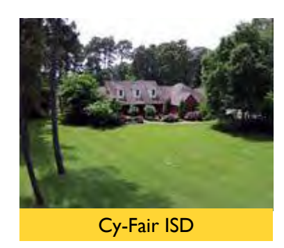
5 acres w/ Beautiful Exec Home, 2 Storage Bldgs., & Pool