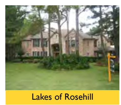
Stunning 5 bdrm, pool, 3-car on 3/4+acre