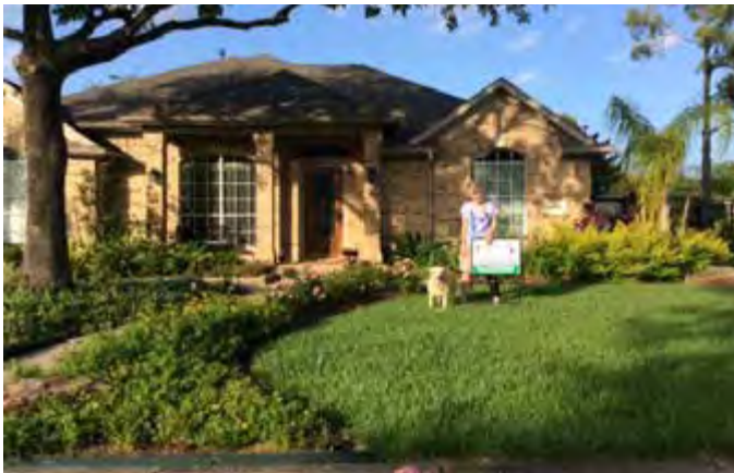
8802 Wheatland Dr.