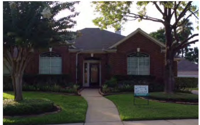
9707 Throckmorton Ln.