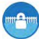
MULTIPLE BARRIERS AROUND WATER