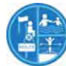
BE SAFER IN OPEN WATER