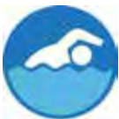
LEARN TO SWIM