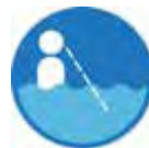
CHECK WATER SOURCES FIRST