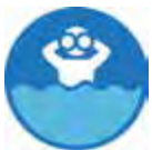
CONSTANT VISUAL SUPERVISION