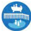
KEEP YOUR HOME SAFER