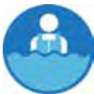
WEAR LIFE JACKETS