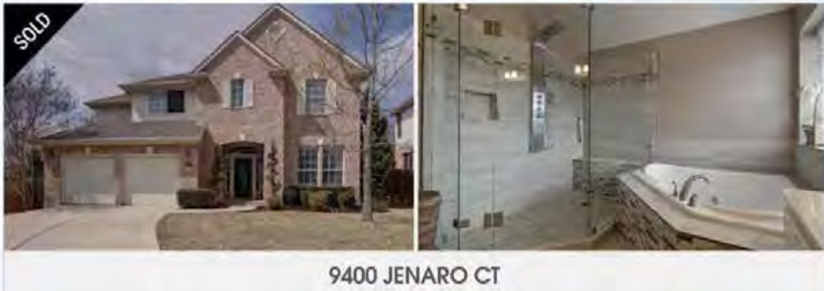
9400 JENARO CT

Just sold 9400 Jenaro Ct., listed at $439,000