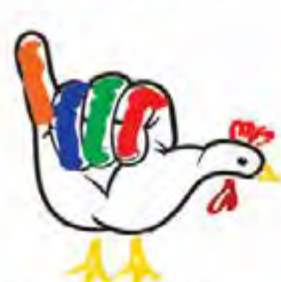
Love You, Man Turkey