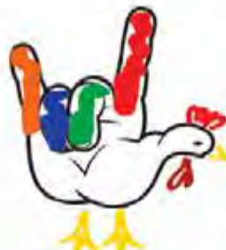
Rock On Turkey