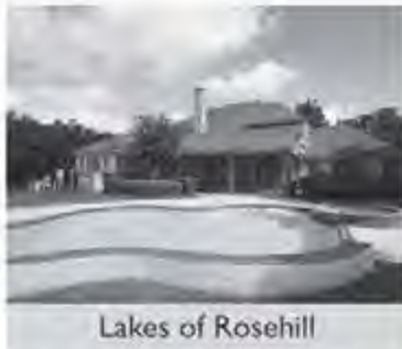
Lakes of Rosehill

Coveted Lakes of Rosehill for less than $500K