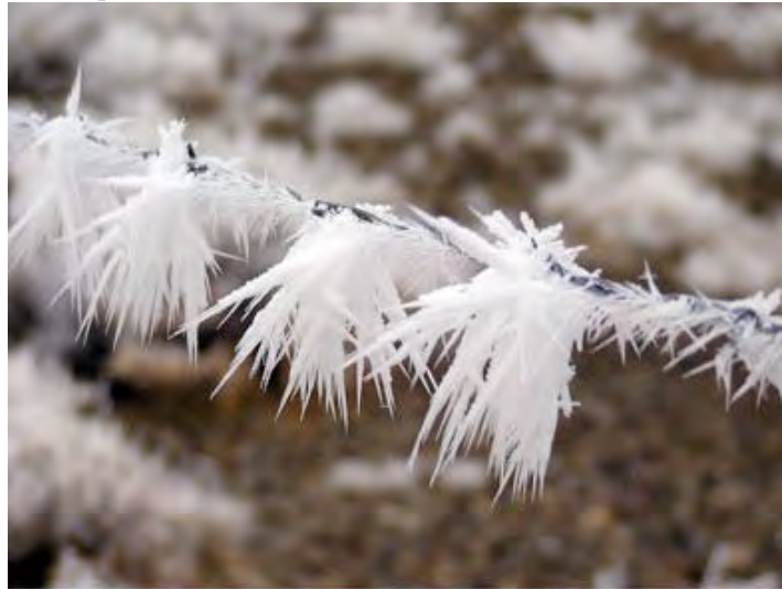
Hoar frost on barbed wire

The most significant factor that determines the basic shape of the ice crystal is the temperature at which it forms, and to a lesser degree humidity. The intricate shape of a single arm of a snowflake is determined by these atmospheric conditions as the entire crystal falls. As slight changes in temperature and humidity occur minutes or even seconds later, a crystal that begin to grow in one way might then change and branch off in a new direction. Since all six arms of a snowflake experience the same changes in atmospheric conditions, they all grow identically. And since individual snowflakes encounter slightly different atmospheric conditions as they take different paths to the ground, they all tend to look unique, resembling everything from simple prisms and needles to intricately faceted plates and stellar dendrites.