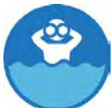
WATCH KIDS & KEEP IN ARM'S REACH