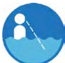
CHECK WATER SOURCES FIRST