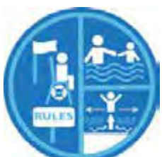
BE SAFER IN OPEN WATER