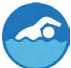
LEARN TO SWIM