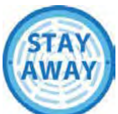
PRACTICE DRAIN SAFETY