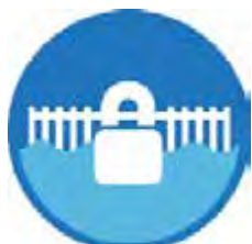
MULTIPLE BARRIERS AROUND WATER