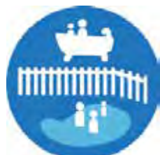
KEEP YOUR HOME SAFER