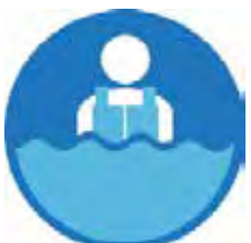
WEAR LIFE JACKETS